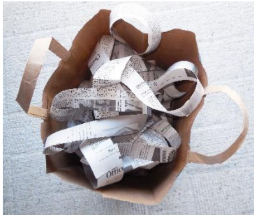
Bag full of Möbius strips

Late to school, I stood in the living room, crying. "I have to leave now!" I said. My coat was on, I was ready to walk the mile to school in the spring sunshine after going home for lunch. Third grade was important and I was worried about being in trouble.